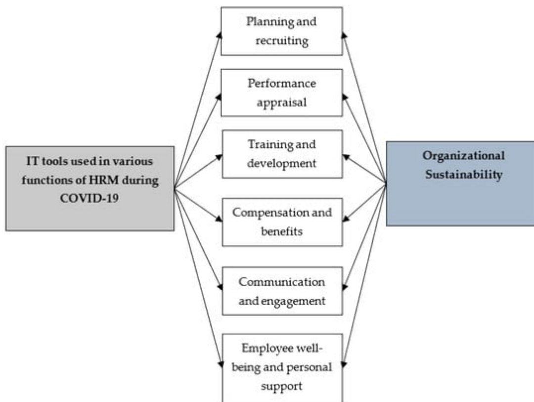
Figure 3. Association between HR strategies and organizational sustainability.

Figure 3 illustrates the conceptual model that has been developed based to associate the variable HR strategies and organizational sustainability.